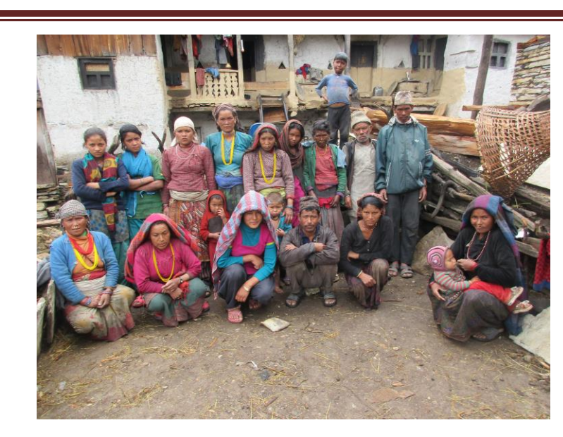
Group Discussion with the community people