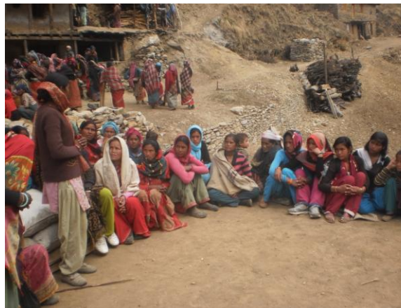
Figure 2 ANM discussing about MBC in Tamti