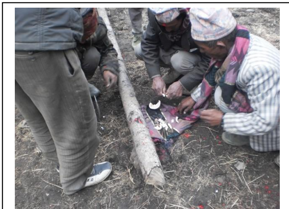
Figure 1 Community following traditional process to inaugurate MBC in Tamti

MBC and various maternity related issues through its local radio. In addition to this, Outline media brings local issues through FM Radios, news papers, television and facebook.